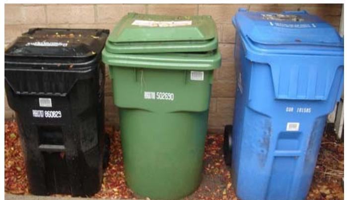
A typical set of disposal bins.

If you live in a single family home and you are already a Department of Water and Power customer in Los Angeles all you have to do is call the Bureau of Sanitation and request a recycle bin. Since you are already a DWP customer and pay for trash collection they will send you a recycle bin free of charge. Once again that number is (800) 773-2489. You can visit their website at www.lacitysant.org