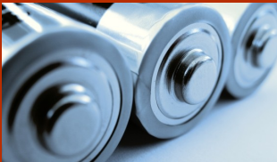
Rechargeable batteries are the way to go!

To dispose of batteries you can drop them off at Home Depot, Wal-Mart, Staples, AT&T and many more places. You can go green by purchasing rechargeable batteries. For more places to recycle visit: www.Earth911.com